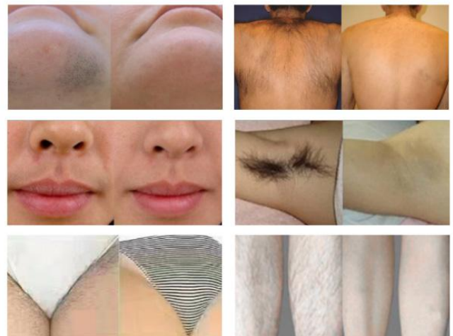
Before & After